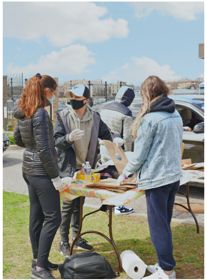
Students from Leon M. Goldstein High School