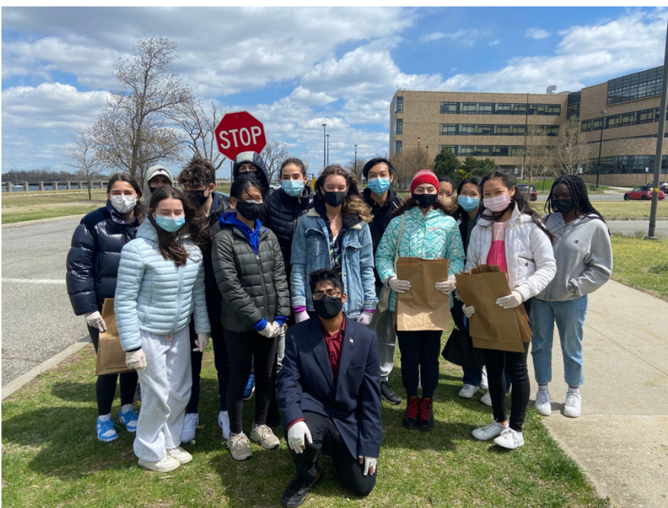
Students from Leon M. Goldstein High School